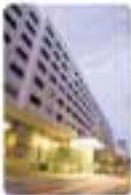
Hotel NH Constanza (4*) Deu i Mata 69 - 99